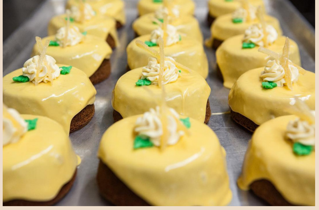
Featured Image: The Vegan and Gluten-free Gingerbread Liliko'i Personal Cakes